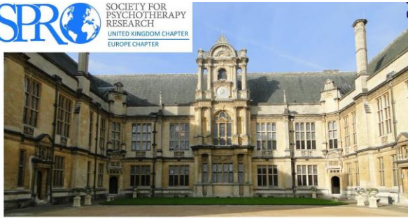
Oxford Conference, 20-22 September 2017