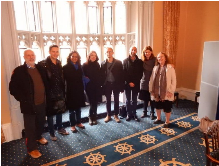
Members of the Oxford conference committee