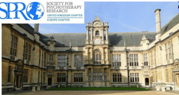
Oxford Conference, 20-22 September 2017

The conference website provides more information about Colleges closest to the conference venue: http://www.sprconference.com/EU-UK-2017/elements/travel.html