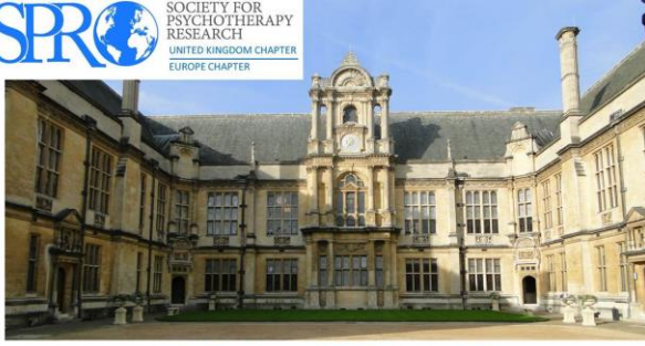
Oxford Conference, 20-22 September 2017