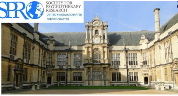
Oxford Conference, 20-22 September 2017