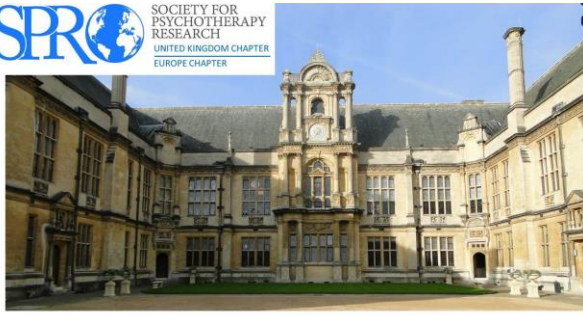
Oxford Conference, 20-22 September 2017